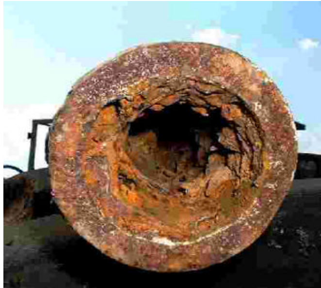
The interior of a pipe needing to be renewed by Operation Clearflow

The Chamber has been building on its growing relationship with Wessex Water to help reduce the impact of forthcoming road works in the eastern end of Yeovil.