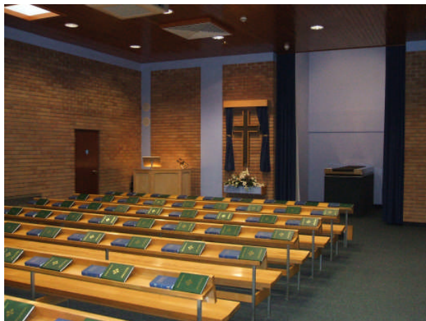
The newly refurbished Crematorium Chapel

The next improvement planned for the Chapel is the introduction of new seating, which will increase the seating capacity of the room and achieve a more flexible layout. The seating is due to be installed over the coming months.