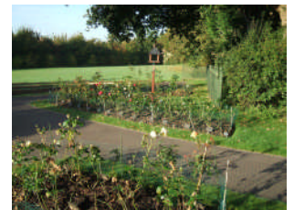
New Memorial Rose Garden

In creating the garden, the opportunity was taken to improve the drainage on the south side of the Crematorium grounds and to install a new bridge, making access easier for persons with a disability.