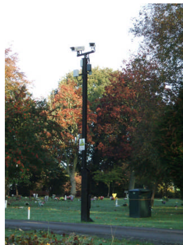
CCTV Surveillance—Protecting Crematorium Users

In line with the Committee's policy of continuous improvement, security at the Crematorium is under constant review, and further steps will be taken as necessary to ensure that the interests of visitors and the Crematorium are safeguarded.